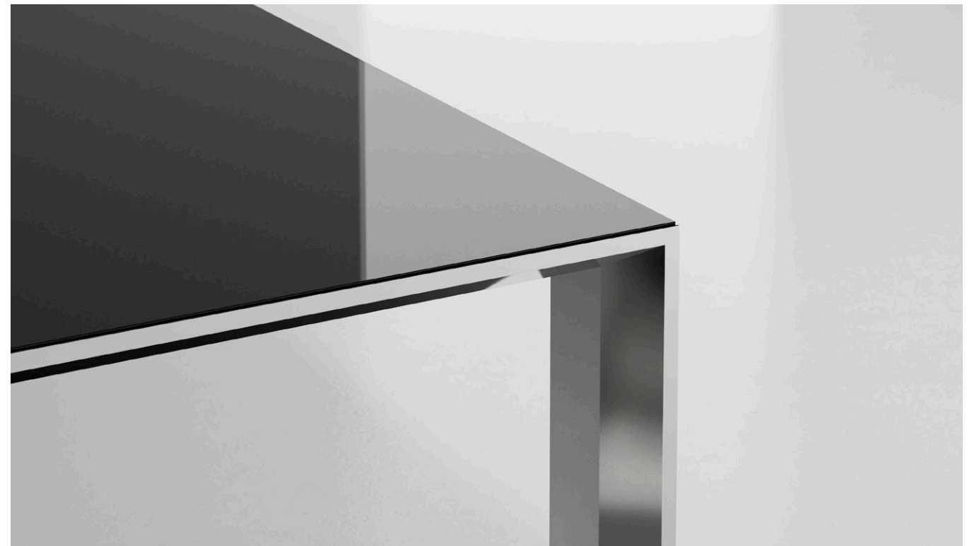
RATIO IN POLISHED STAINLESS STEEL AND BLACK BACK-PAINTED GLASS