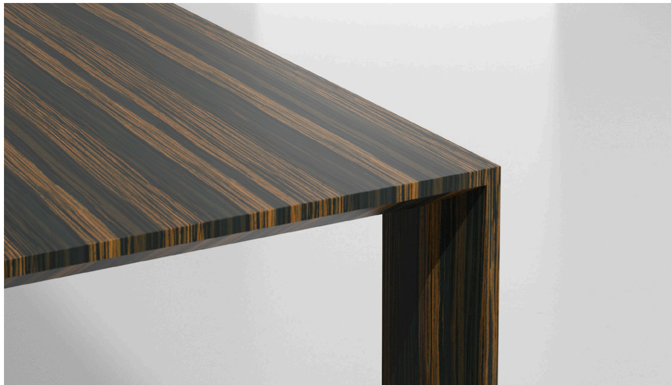
RATIO IN EBONY #502