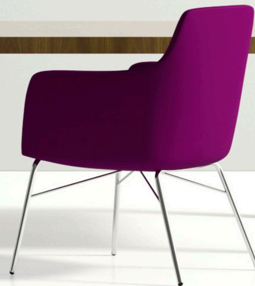
RATIO IN FLAT-CUT WALNUT #125, 30" HEIGHT