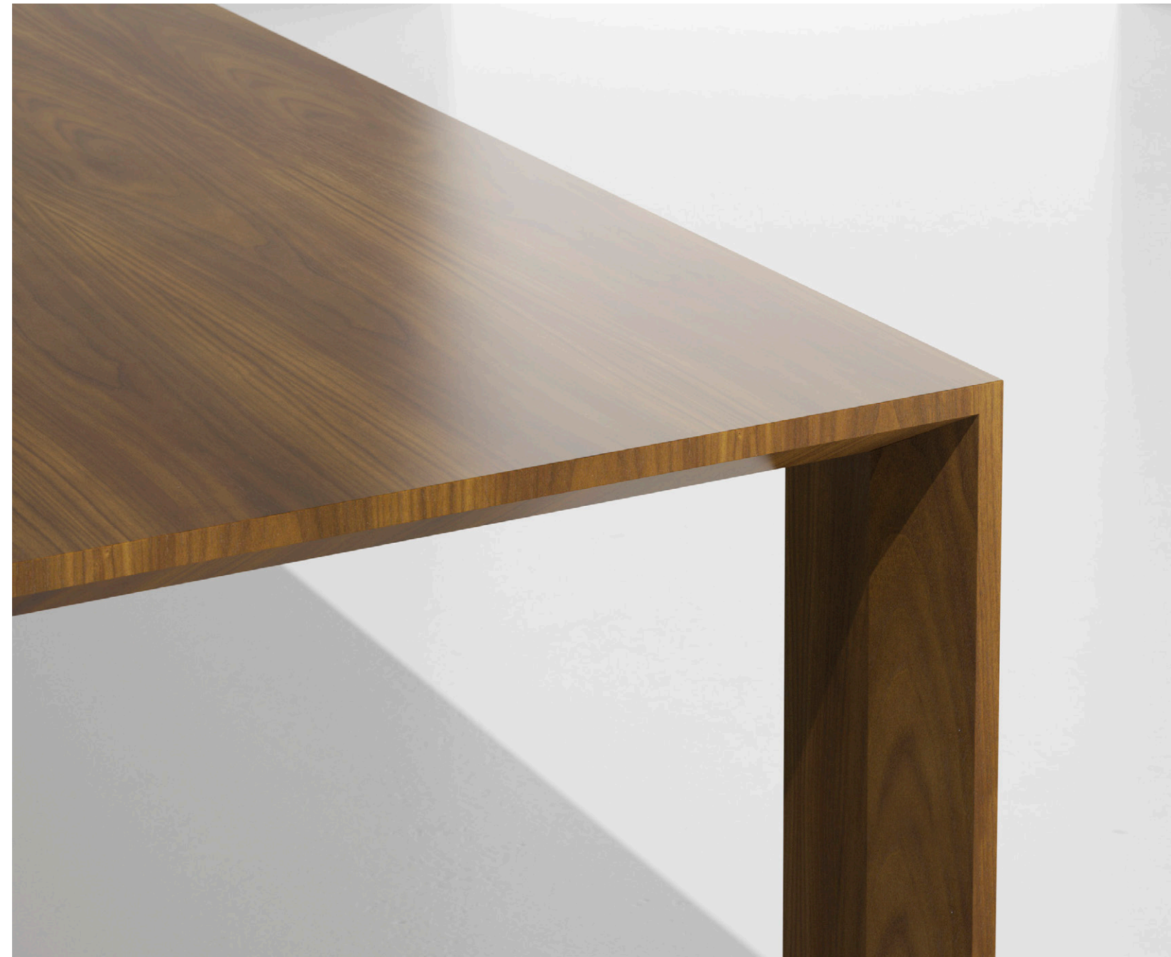
RATIO IN FLAT-CUT WALNUT #125

Designed by Brian Graham, the Ratio table reinvents the classic farm table in modern form, accommodating purpose and function in a straightforward manner that makes clear the merits of decorum, the value of fine materials and the enduring value of the table as a place to gather, connect and celebrate. “An elegant table,” says Graham, “is a tangible presence, a surface and a site that invites us to participate, to converse, to exchange ideas and form alliances. It is an icon of transaction and esprit de corps.” Robust yet refined, the beauty of this simple table is testament to the craftsmanship and veneer artistry of Decca Contract.