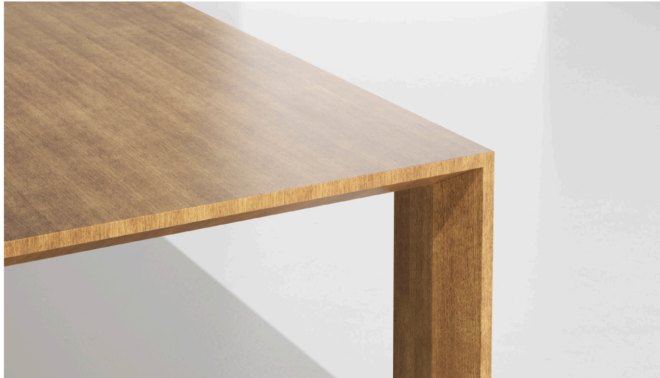
RATIO IN QUARTER-CUT NATURAL OAK #126